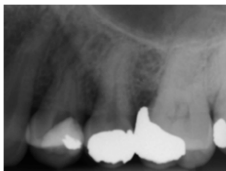
Figure 1. A long cone periapical radiograph used to assess the UL4 prior to endodontic treatment and localized periodontal pocketing around the mesial aspect of the UL6.