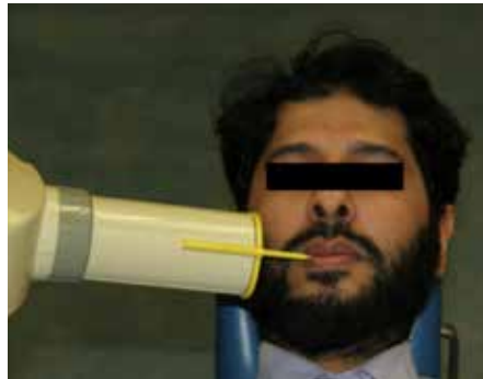
Figure 4. A photograph demonstrating a more horizontal beam angulation obtained when taking a bitewing radiograph for the upper right first molar tooth.

When such an image is used to help assess the status of a heavily restored posterior tooth, it is likely to have the