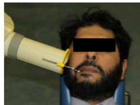
Figure 2. A photograph demonstrating the angulation obtained when taking a long cone periapical radiograph of a patient's upper right first molar tooth.