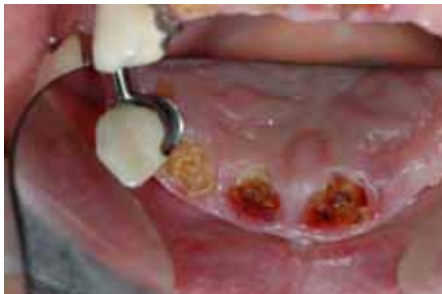
Figure 2. Gross secondary caries evident after removal of conventional crowns at UR1, UR2 and UL1. The patient will need a different restorative strategy to restore these teeth successfully.