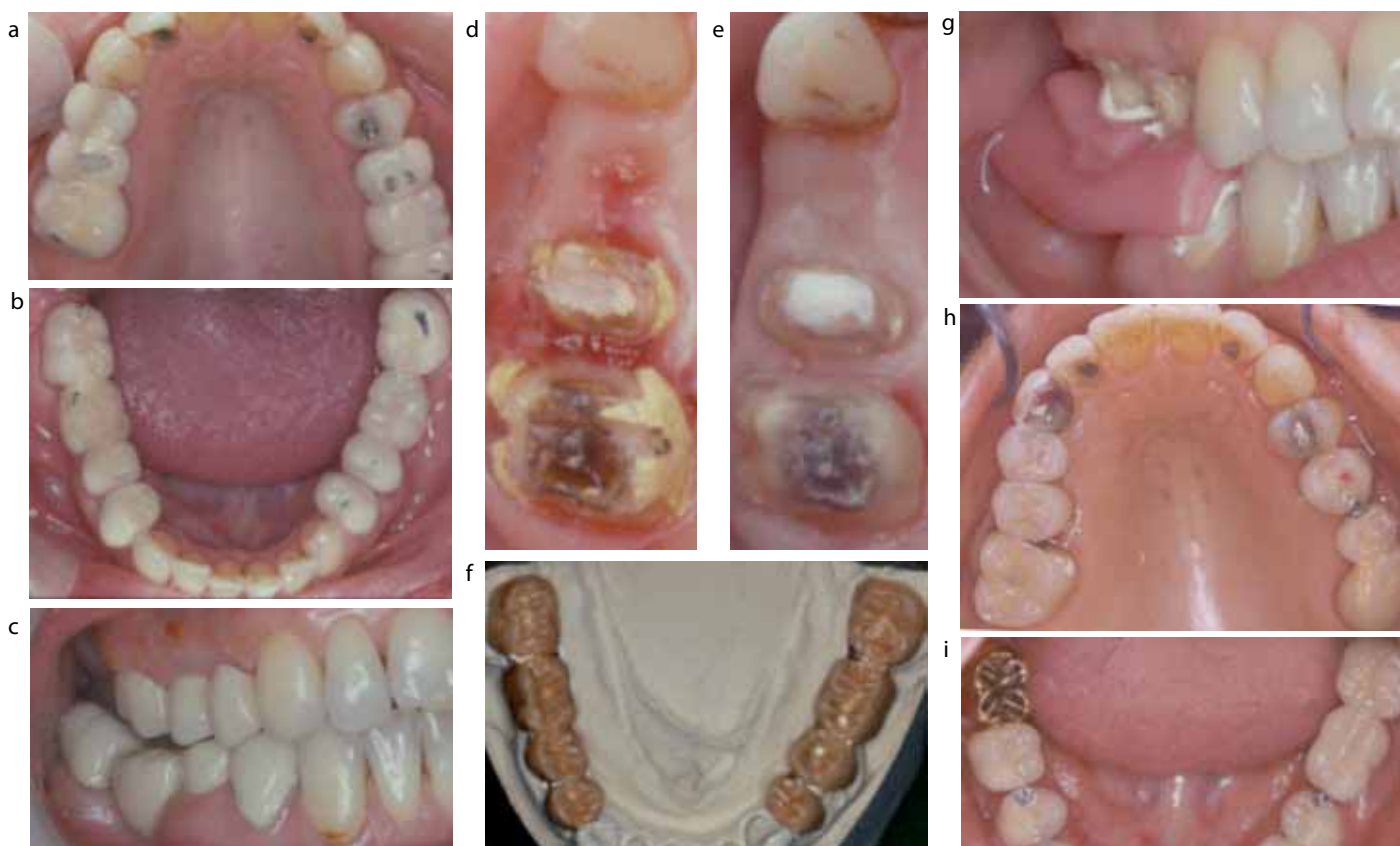
Figure 5. (a) Case 3: Upper occlusal view showing two posterior PFM bridges in the upper arch. (b) Lower occlusal view – the lower left quadrant restored with a 3-unit fixed-fixed conventional bridge. The lower right quadrant was restored with a 4-unit conventional bridge. (c) A right buccal view illustrating a lack of occlusion and posterior function of the upper and lower PFM conventional bridges on the right-hand side. The patient has an endodontic sinus from the failed RCT of the UR5. There was arrested bucco-cervical caries on the LR3 and areas of localized plaque-induced gingivitis. (d) Occlusal view after removal of the bridge in the upper right quadrant to allow investigation of UR56. Note gingival inflammation around the UR56 and the lack of occlusal height with UR5. (e) Occlusal view after crown lengthening surgery and temporization of UR56. The UR5 also required apical surgery. Note that the UR3 is unrestored and therefore amenable to act as an abutment tooth for a predictable adhesive bridge. (f) Full contour diagnostic wax-up created prior to removal of bridges. Also used to construct indirect provisional restorations. (g) Right buccal view after investigation and restoration of the abutment teeth. The patient had temporary bridges in situ for three months to make the best assessment of the modified occlusal scheme. Definitive bridges were placed on the right side first. An interocclusal record was taken with Micro-Beauty Wax (Moyco, USA) which was only supported by the prepared posterior teeth on the right side. The anterior natural teeth and the left provisional bridges stabilized other areas of the occlusion during the right jaw registration, which was further refined by reline with TempBond (Kerr Dental, UK). (h) Upper occlusal view of the fit and adjustment of the restorations in the URQ. Note the distal cantilever adhesive bridge replacing the UR4. The occlusal aspects of UR45 will be polished once the occlusion is appropriate. The UR4 has been restored with a distal adhesive bridge from UR3 which allows the root-filled UR5 to be restored as an individual crown. Upper left quadrant has been redesigned with fixed-movable restoration. The ‘bottomed-out’ female portion of the joint is placed within the distal aspect of the minor retainer (UL5) and the male component is part of the anterior aspect of the pontic. (i) Lower occlusal view after final cementation of the definitive bridges. (j) Anterior view after review of replacement crowns and bridges. Note that the sinus has healed at UR5. Pre-operative discussions confirmed that lip line allowed patient to accept metal collars.

General Dental Council (GDC). The commonest area of complaint was treatment related to crowns (196) followed by bridges (116). 16