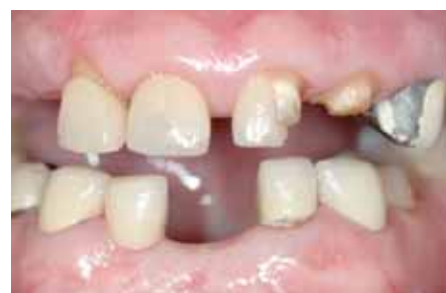
Figure 1. A patient with likely parafunction showing evidence of failure of both adhesive ceramic and conventional fixed restorations.

If conventional crowns and bridges are prescribed and maintained well they are likely to provide good clinical service and value for money. However, unless the restorations