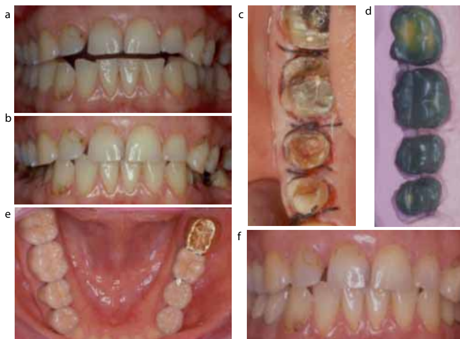
Figure 6. (a) Case 4: Anterior view – the patient had a partial coverage splint that extended from UR2 to UL2 and was worn constantly. The patient presented with an anterior open bite and contact on her posterior teeth and temporary posterior restorations only in her inter-cuspal position (ICP). Thin unreliable provisional restorations were in situ on the LR4567 and LL457. (b) The lower posterior temporary restorations were removed to allow contact between the anterior teeth at a reduced vertical dimension. At this vertical dimension the patient was comfortable and able to display lateral and protrusive guidance on the natural anterior teeth. It was also felt that this relationship would aid the fabrication of the posterior restorations. (c) Occlusal view showing the LR4567 after crown lengthening surgery which was needed to improve their clinical crown height. Note that the root-filling of LR5 was exposed to oral fluids. (d) 'Cut-back' wax-ups for the metal substructures of new PFMs for LR4567. A pink putty matrix was taken of the full contour wax-ups. This ensures optimum design, thickness of metal and support of future ceramic. (e) Lower occlusal view after cementation of definitive restorations. The patient requested tooth-coloured occlusal surfaces where possible. Individual PFM crowns were placed on LL4 and LR4567. The bridge in the lower left quadrant was redesigned to incorporate a movable joint into the posterior part of the LL5 with PFM full coverage minor retainer and a pre-ceramic soldered full veneer precious metal crown as the distal major retainer. (f) Anterior view at 24 months after placement of her definitive mandibular restorations. The patient was able to contact her anterior and posterior teeth in her ICP.

This female patient was referred with pain and infection under her conventional bridge in the upper right quadrant and an inability to make occlusal contact and function with her posterior bridges. The patient was a medically well 50-year-old. Figures 5 (a–j) outline the practical steps of investigating the status of underlying tooth tissues and improving