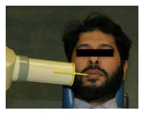
Figure 4. A photograph demonstrating a more horizontal beam angulation obtained when taking a bitewing radiograph for the upper right first molar tooth.

When such an image is used to help assess the status of a heavily restored posterior tooth, it is likely to have the