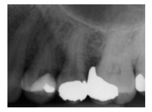
Figure 1. A long cone periapical radiograph used to assess the UL4 prior to endodontic treatment and localized periodontal pocketing around the mesial aspect of the UL6.

The radiographic beam to be at 90 degrees to both the tooth and film.